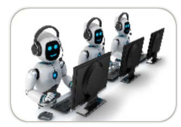
Robot Process Automation (RPA)