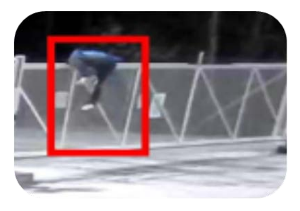
Video analytics and 360° videos