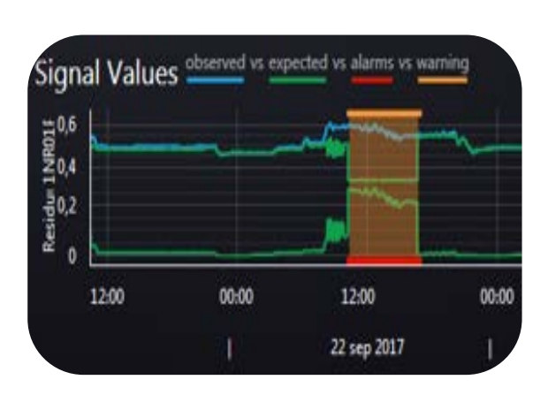
Pattern recognition and Anomaly detection