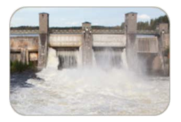
Machine learning Autonomous operation