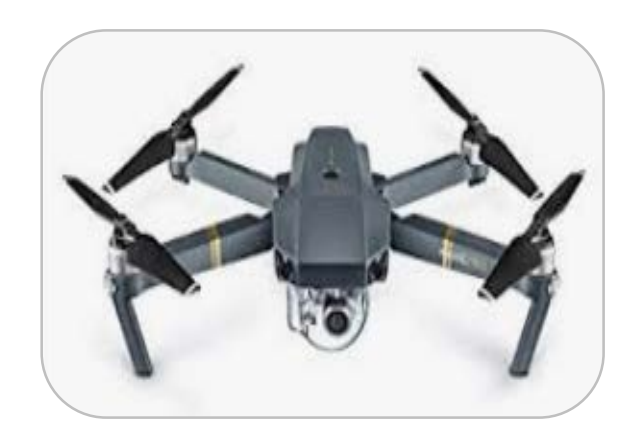
Drone and thermal camera