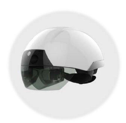
Virtual and Augmented reality